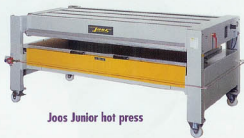
Joos Junior hot press

"For what it's designed to do, it's a great machine."